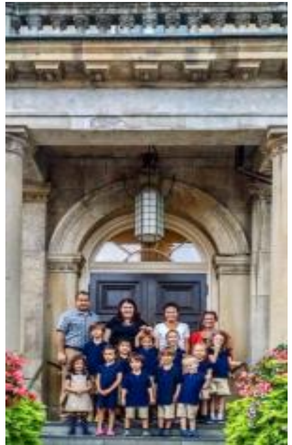
The Original Royal Oak Class, September 2015

Royal Oak Community School does not receive government funding of any kind and relies on the generosity of donors and our yearly fundraisers to provide this access for all.